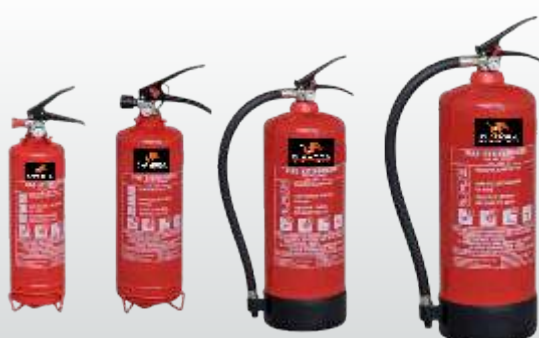
Portable DCP extinguisher come in all sizes from 1Kg-12Kg