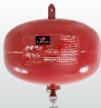
Automatic Fire Extinguisher