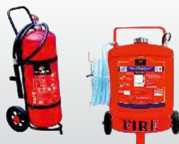
DCP portable trolleys