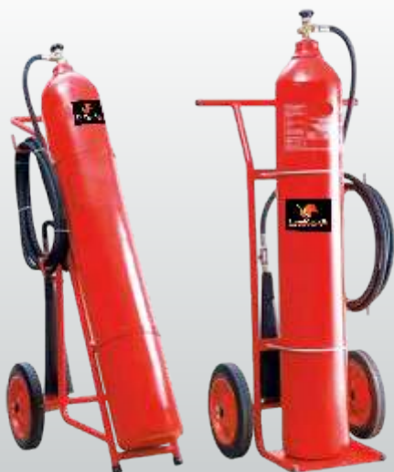
Carbon dioxide Trolley

Co2 come in standard sizes from 2kg and 6kg portable extinguisher to 10kg trolleys