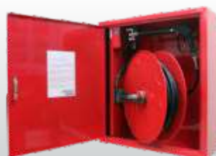
Hose reel with cabinet swinging type