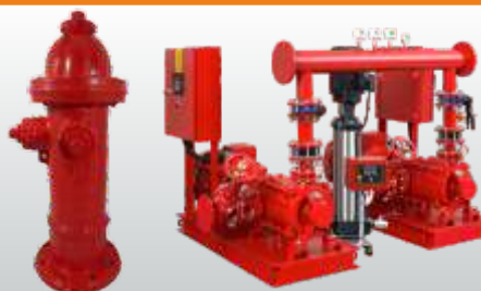
Hydrant Fire Pump