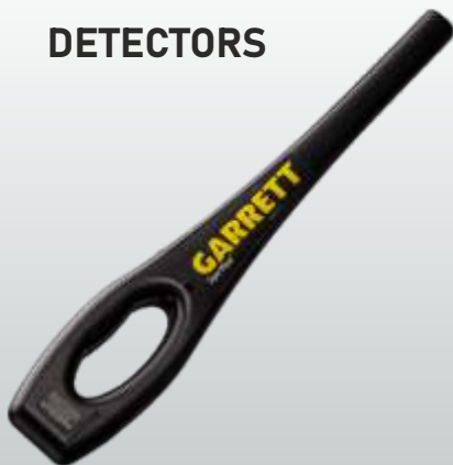
HAND HELD DETECTORS